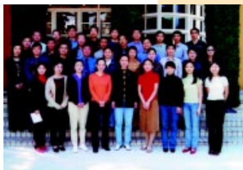
為西安學習團開辦培訓課程 Conducting training course for a study group from Xi'an, China