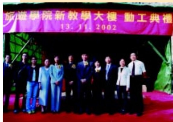
新教學大樓「啟思樓」動土儀式 Ground-breaking Ceremony for the new campus building - "Inspiration Building"