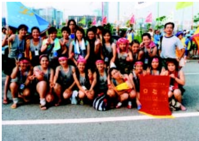
參加「澳門國際龍舟邀請賽」 Participating in "Macao International Dragon Boat Race"