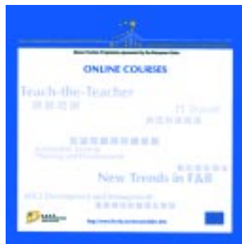
「澳門－歐洲旅遊高等研究中心」網上學習課程開課 Kicking off e-learning courses of ME-CATS