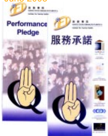
推出「服務承諾」計劃 Launching "Performance Pledge"