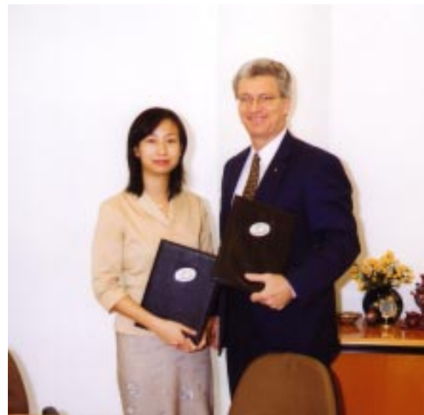
與美國普渡大學探討合作協議 Discussing Cooperation with Purdue University, USA