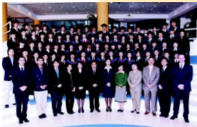
旅遊高等學校畢業典禮 Graduation Ceremony of the Tourism College of Macao